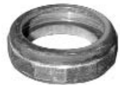
DIE CAST NUT